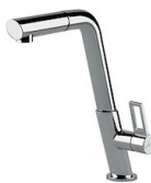
Mixer Tap KE