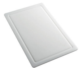
HDPE Chopping board 8657 001