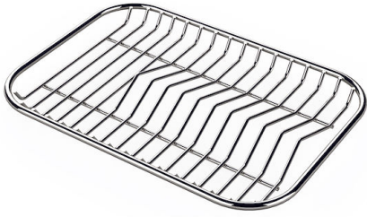
Stainless steel plate rack only usable in combination with the accessories 8644 003